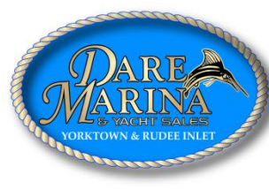
2012 Tournament Winners