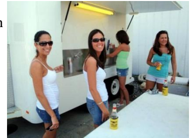
Captain's Meeting Kick-Off