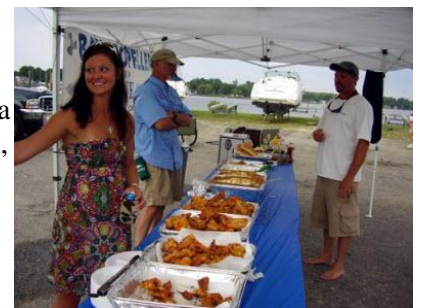
A Seafood Feast for Everyone!

For the fourth year in a row, the weather and the flounder cooperated for a fantastic day of fishing. Flatfish were caught from buoy 42, the Cell, 36A, the Hump, Back River Reef, Cape Henry Wreck and the Chesapeake Bay Bridge Tunnel. Although fishing was good all over the lower bay, the Chesapeake Bay Bridge Tunnel was the place to be. Almost all of the large flounder caught came from between the 4 th island and the high rise section. The 2012 tournament produced some fantastic catches and an even better tournament celebration.